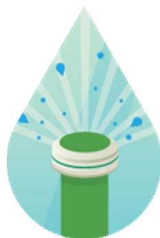
ADJUST SPRINKLERS & FIX LEAKS