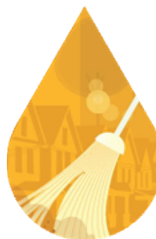
USE A BROOM NOT A HOSE