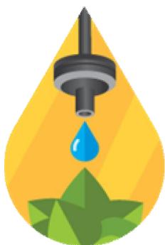
INSTALL DRIP IRRIGATION

For more tips please visit www.saveourwater.com